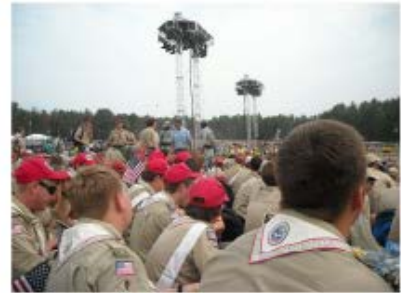
SCOUTS FROM ACROSS THE NATION GATHER AT JAMBOREE FOR THE OPENING SHOW AT THE ARENA