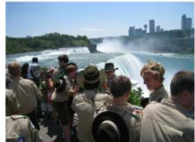
SCOUTS LOOKING OVER THE RAILING AS WATER FLOWS OVER NIAGARA FALLS