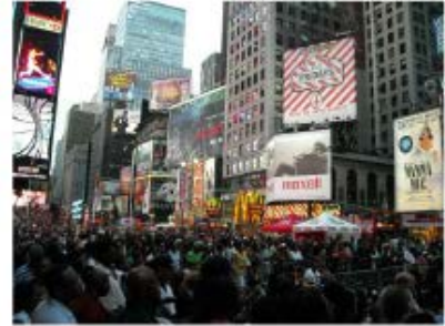
SCOUTS VISIT TIME SQUARE IN NEW YORK CITY