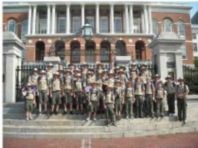
SCOUTS GATHER IN FRONT OF MASSACHUSETTE STATE HOUSE FOR A TROOP PHOTO