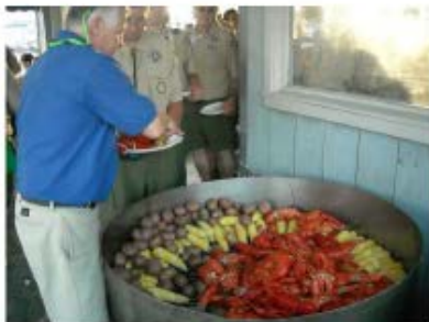
A FEAST FIT FOR ANY GROWING SCOUT OF LOBSTER, CORN and POTATOES