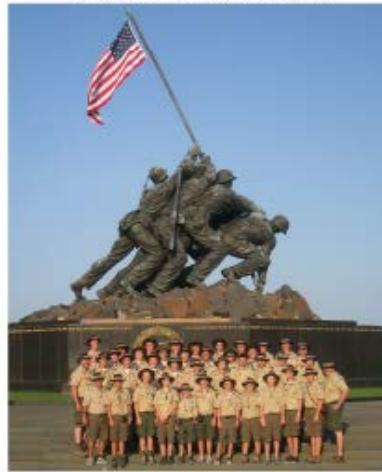
SCOUTS GATHER IN FRONT OF THE MARINE CORPS MEMORIAL (IWO JIMA MEMORIAL) AT ARLINGTON