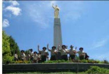
SCOUTS WAVE AT THE PHOTOGRAPHER AT HILL CUMORAH, PALMYRA, NY