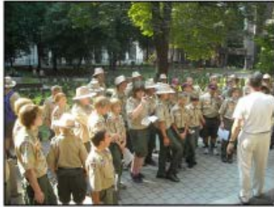
SCOUTS LISTEN AS A LOCAL TOUR GUIDE EXPLAINS THE HISTORY OF BOSTON